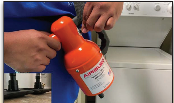
Compact. Powerful. Ready To Move.

The Airsled kit is incredibly easy to use and convenient to carry.